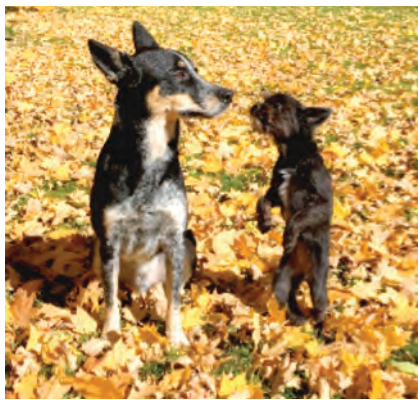
Scout & Luna – Truly the Best of Friends!

"I was informed by authorities that my mother was a large Black Bear, but apparently my DNA test indicated otherwise. I'm just a little Chorkie."