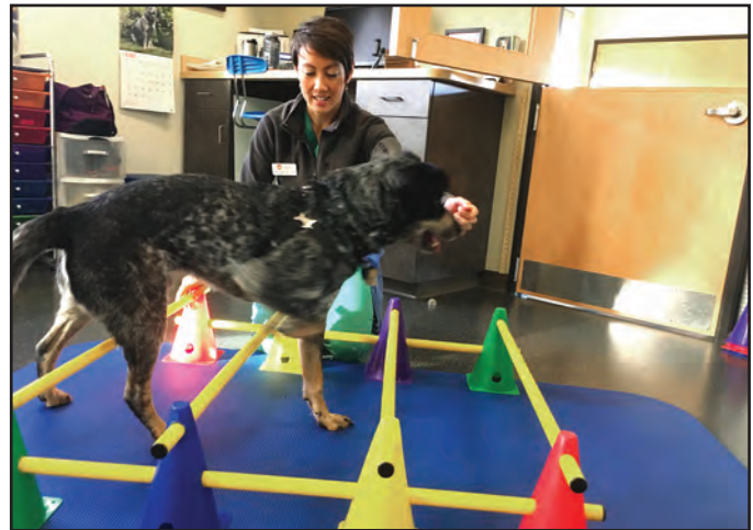
Figure 2. Cavaletti Rails. Rangler navigating Cavaletti rails for range of motion and strength.